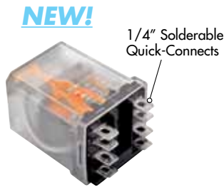
Plain Cover Option C