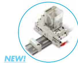
389 Relay with the 70-788EL11-1 Socket